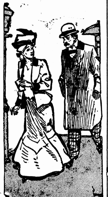
"ARE YOU FOLLOWING ME?" SHE DEMANDED.

Menger as was Jenny's salary, one half of it had paid for the tiny room on Mrs. Cady's third floor and furnished Jenny's inadequate supply of food and clothing, and the other half until the last two months had gone regularly to her mother on the little unproductive Rhode Island farm. But these last two months had made a new division in the stipend. Now it was in three parts, and the third went to the fourth floor of Mrs. Cady's apartment house to a room even more tiny and bare than her own. She had heard a low moaning one day, apparently from the room above, and had gone up and tapped anxiously on the door. Several minutes had passed before she heard a feeble step across the floor, and then the door had opened, and she had