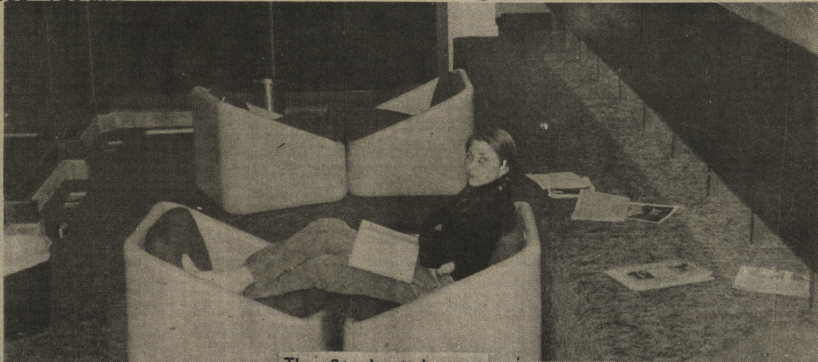
The Student Lounge

Carrels, group and individual study rooms plus classrooms, the computer room, the language lab, and lecture theatre comprise the study facilities available in the library. Students have access to additional equipment such as typewriters and copy machines. There are three lounges within the library that the students may use -- two smoking lounges within the library itself and one centrally located in the building. After a class, people have a chance to meet their friends, eat their lunch, or study. The facilities are for you; take advantage of them!