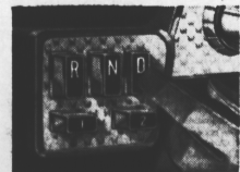
Push-button driving. Modern, all-mechanical push-button controls make lever-shifting obsolete! Just press a button with your finger tip and Torque-Flite automatic drive does the rest! Trouble-free, proved in use and standard equipment with every De Soto!