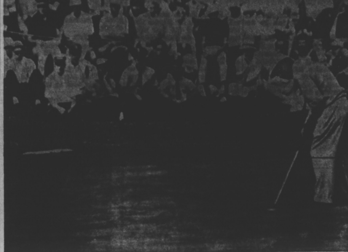
A NEAR MISS

The Pontiacs defeat of last year's champions of the Charlotte league has given the Prince County softball league a real shot in the arm. We don't mean to imply that Pontiacs owed any decided superiority over the visitors — our heads haven't swelled to that extent. We realize that the Pontiacs had to have the breaks to come up with that victory. If the Pontiacs had stayed on the slab, they might have kept those Pontiacs in low gear all through the contest — and there are a few "ifs" and "buts" that keep us thinking along modest lines. At the game did seem to show that the Prince County softball league is growing out of its raddling clothes, and is perhaps narrowing the gap a little between the Charlotte brand softball and ours. We'll grant that a team may come down from the capital city and knock our ears—but good. But we're steadily improving our line and should be able to graduate into senior ball very soon. We think there should be more inter-town games. I would tend to increase interest in both centers. The Charlotte league has been very popular in their city with a lot of loyal followers. We know, and we think they know, that it takes a real, steady-to-godness, up-and-af-kan-mer-side that dreary Saturday nothing has been done to keep the wheels turning. Don't just stand there, baseball promoters, do something!