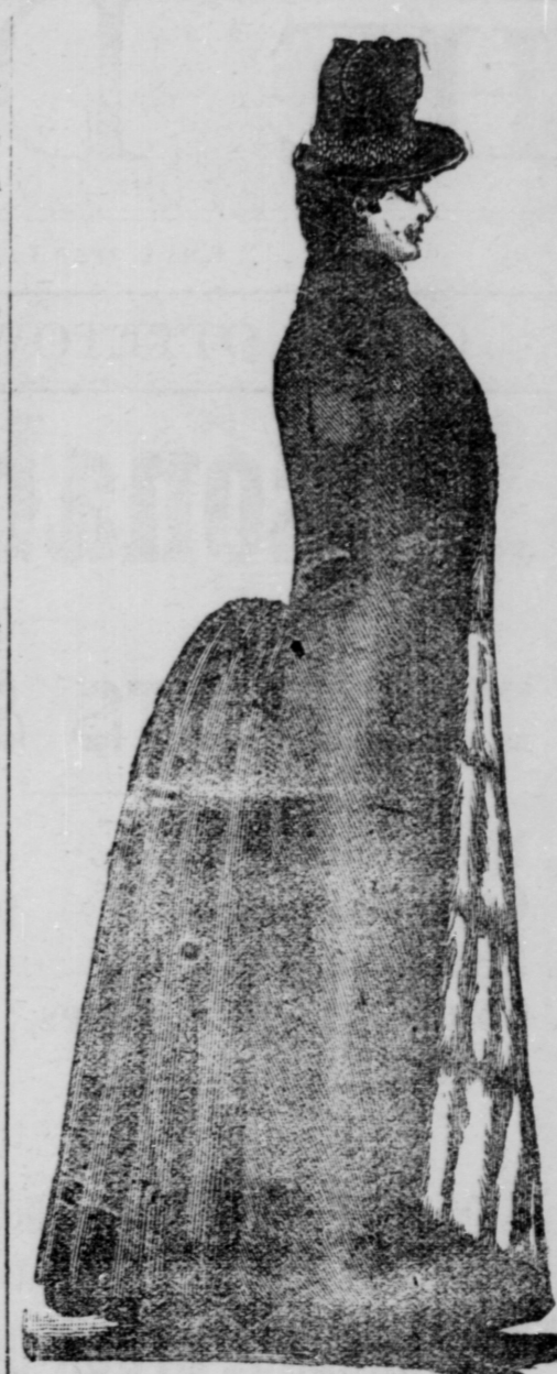
Charlottetown, Nov. 16, 1888—dy & wy

All kinds of Legal Business promptly attended to. Money to Loan at low interest.