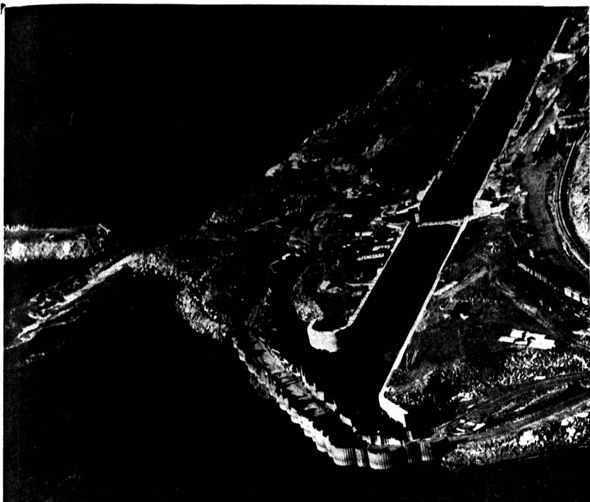
Aerial View Of The Canso Causeway