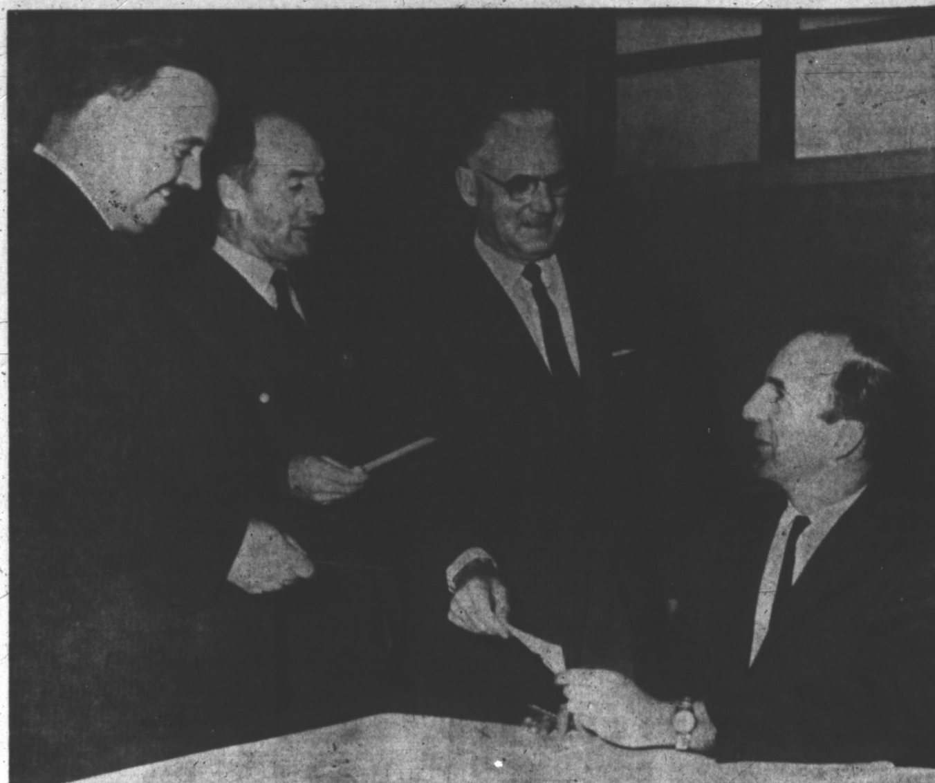
THE SECOND Sportsmen's Dinner at Summerside, billed as being even better than the first, has already been started on the road to success, as the first tickets went on sale this week, a month prior to the event, scheduled for Feb. 6. The first tickets to the $25