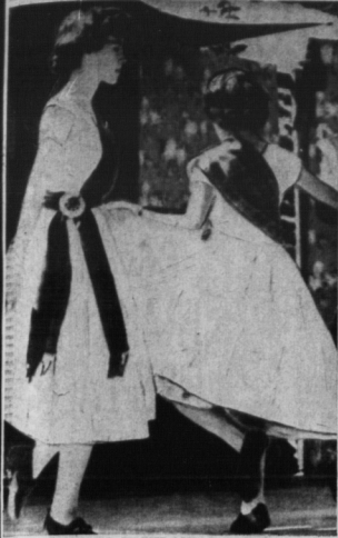
SPIRITED HIGHLAND DANCERS