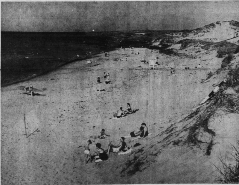
MORE THAN ONE THOUSAND MILES OF BEACHES MAKE P.E.I. A MAMMOTH PLAYGROUND FOR OLD AND YOUNG