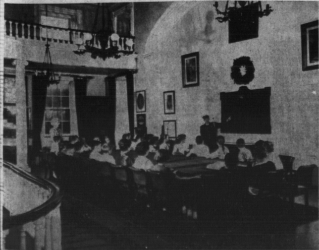
TOURISTS FLOCK TO HISTORIC CONFEDERATION CHAMBERS WHERE CANADA WAS BORN

"Licensed charter craft are clean, comfortable and safe."