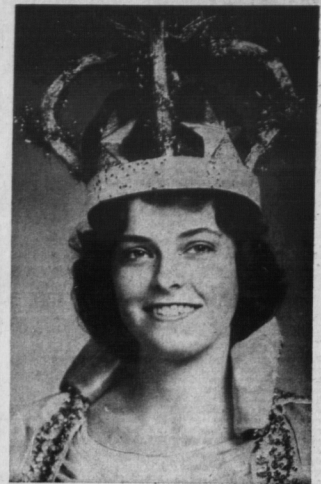
LOVELY MISS P.E.I. OF 1961