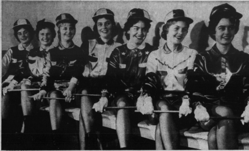
HIGH-STEPPING GOLD CUP AND SAUCER GIRLS WILL FEATURE GIANT OLD HOME WEEK PARADE