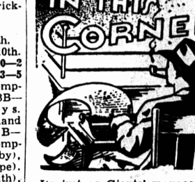
IN THIS CORNER

It's just as Giants' manager, Leo Durocher, said, "Odds don't mean a thing", he snapped just before sending his club against the Tribe in the Polo Grounds yesterday.