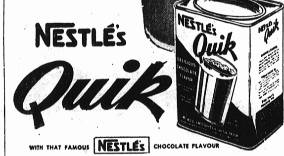
WITH THAT FAMOUS NESTLÉ'S CHOCOLATE FLAVOUR

Mixes in a moment. You never saw anything dissolve so fast. Two heaping teaspoons of Quik in a glass of cold milk... a quick stir... and it's ready to drink. Cool, delicious... and what flavour—all the smooth richness of famous Nestlé's Chocolate. Your children will love Quik, and it's good for them—contains sunshine Vitamin D 2 . Quik makes wonderful chocolate sauce and frosting too—recipes on package. Ask your grocer for Nestlé's Quik... in one pound and half pound sizes. Costs so little—serve often.