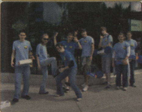
SHine Day, September 5, 2006 Teams Silver and Brown come together at K-Rock/Ocean to shine some shoes.