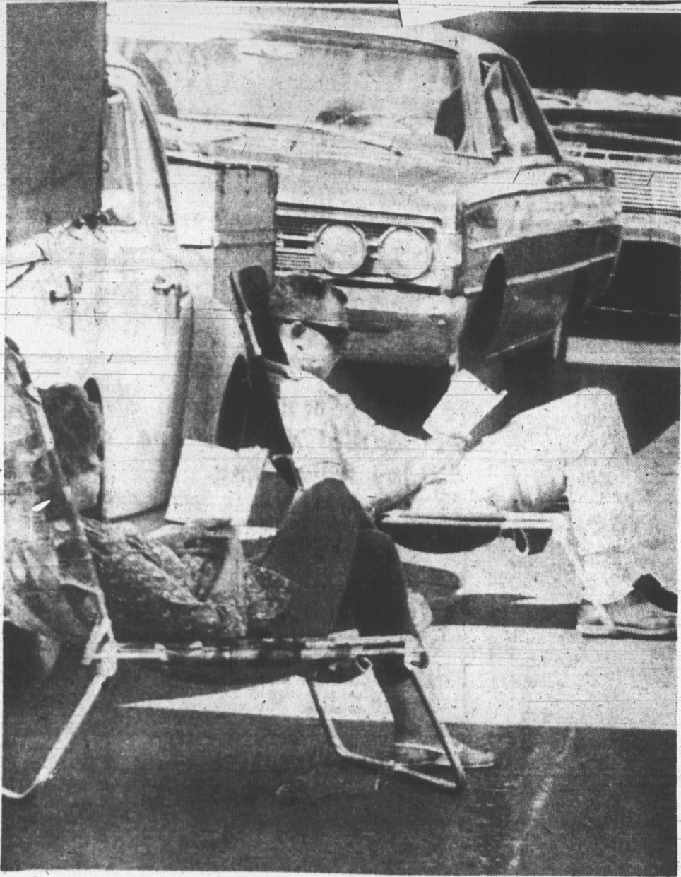
WHAT'S THE USE OF WORRYING

Unidentified Ottawa tourist couple unpacked their lounge chairs and relaxed while waiting for ferry transportation from Borden to the mainland Thursday. They were part of a two-mile queue making a last ditch effort before the CNR ferries halt their services when the country's railways are hit by the strike set for noon today.