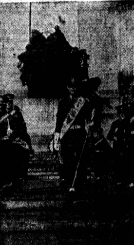
BAND FOR KOREA—The band of the Princess Patricia's Canadian Light Infantry and the Royal 22nd Regiment who have completed tours of duty in the Far East.

leaves shortly for a tour of duty in Korea with Canada's 25th Infantry Brigade. The band follows bands of the Princess Patricia's Canadian Light Infantry and the Royal 22nd Regiment who have completed tours of duty in the Far East.