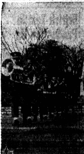
BAND FOR KOREA—The band of the Royal Canadian Regiment on parade at a ceremony at the National War Memorial in Ottawa.