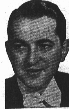
PERCY FAITH Ace Conductor of the Air Waves "To me, a Buckingham is as soothing as good rhythm, and just tops for flavour."