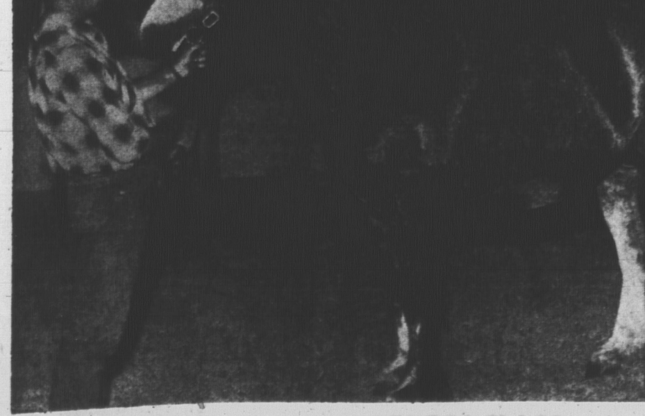
CLYDESDALE MARE TOPS CLASS