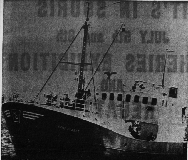
THIS STEEL TRAWLER BUILT AT BATHURST, N.B., IS A SMALLER VERSION OF THE P.E.I. SHIPS