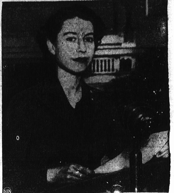
THE EMPIRE LISTENS—Queen Elizabeth II delivers her first Christmas message to the British Empire since her accession to the throne. Speaking from Sandringham, she called on the Commonwealth and empire to work for tolerance and understanding among nations for true peace.

For festive entertaining, or a small buffet supper, nothing is more stunning with your crystal and silver than the gossamer glamour of crochet. Even a simple meal becomes a special occasion when served on this setting. These sturdy doilies measure about six inches in diameter, and can be crocheted in a jiffy. To obtain a leaflet with directions for making these CHIC CIRCLES, send a stamped, self-addressed envelope to the Needlework Department of this paper and ask for Leaflet No. C-7572.