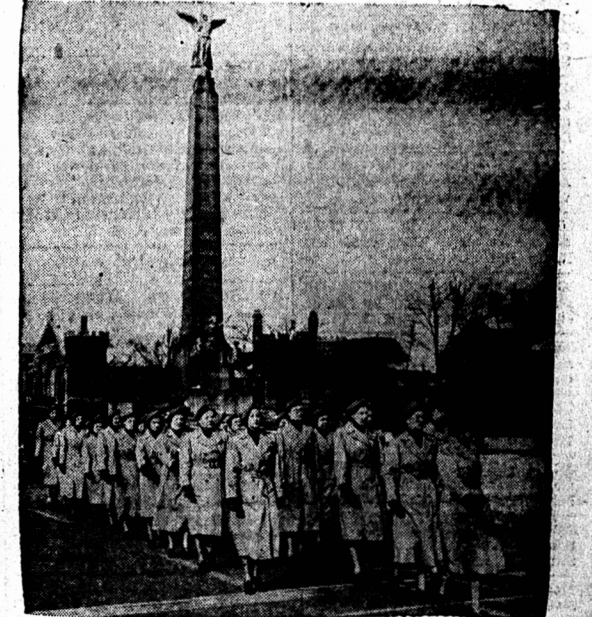
Nearly 300 veterans attended the 50th anniversary of the South African War, in Toronto over the week-end. Among many units parading were these Red Cross women.