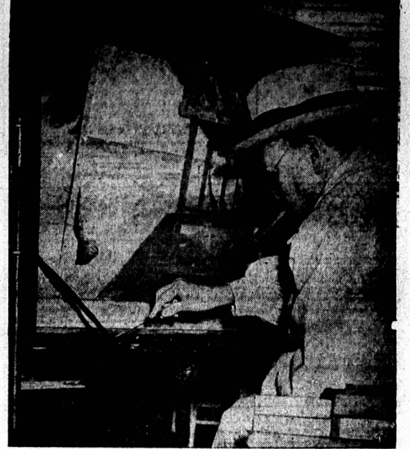
GREETINGS FROM WINNIE — Whatever his future in politics, Winston Churchill has at least one other career assured. The famed amateur painter, seen at work at his easel, has just turned professional. He has signed with a Kansas City, Mo., greeting card company to allow 18 of his paintings to be used on American Christmas cards.