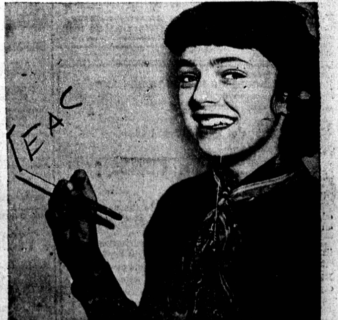
except that article two of code says: "I will abide by laws and regulations of the school and the community."