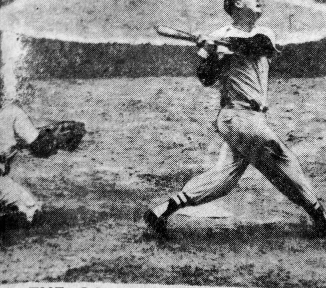
THE CAMERA NEVER LIES?

REMEMBER WHEN . . . Lou Gehrig, after playing 2,130 consecutive scheduled games with New York Yankees—plus 34 games in world series—was benched at his own request 19 years ago today. He announced his retirement shortly afterwards when doctors diagnosed his muscle ailment as a rare type of sclerosis. The great first baseman died two years later, at age 37.