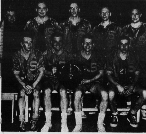
MARITIME HOOP CHAMPS