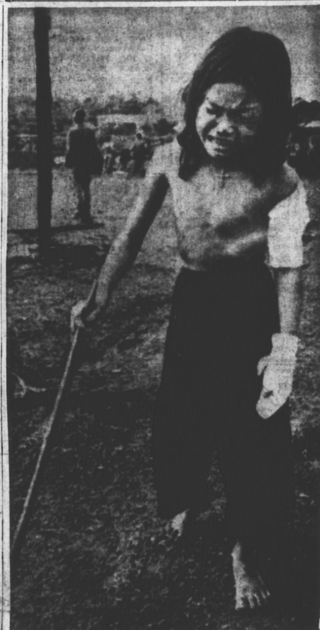
WOUNDED, WEeping GIRL POIGNANT WAR PICTURES TOUCH HEARTS OF MANY

But the police reaction apparently triggered the crowds and they ran through the streets shouting support of Ben Bella, (Continued on page 5 Col. 3)