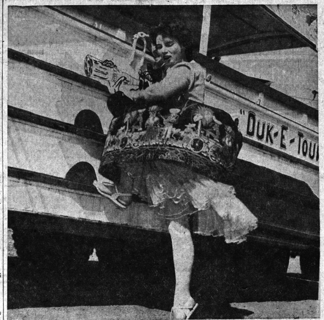
YOU COULD RIDE AN ARMY "DUCK"