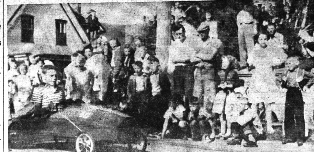
OR YOUR OWN SOAP BOX