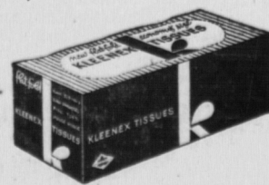
NEW FLAT FOLD Economy-Size Kleenex* tissues