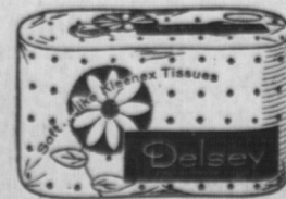
DELSEY* bathroom tissue with that definite difference *Reg. Trade Mark