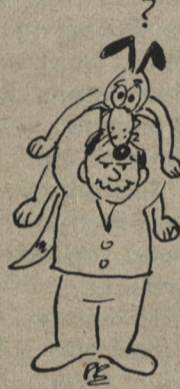
Business putting on the dog!!

If this becomes the case, the fear of UPEI losing its status as a "liberal arts" school to become a community college may be well founded.