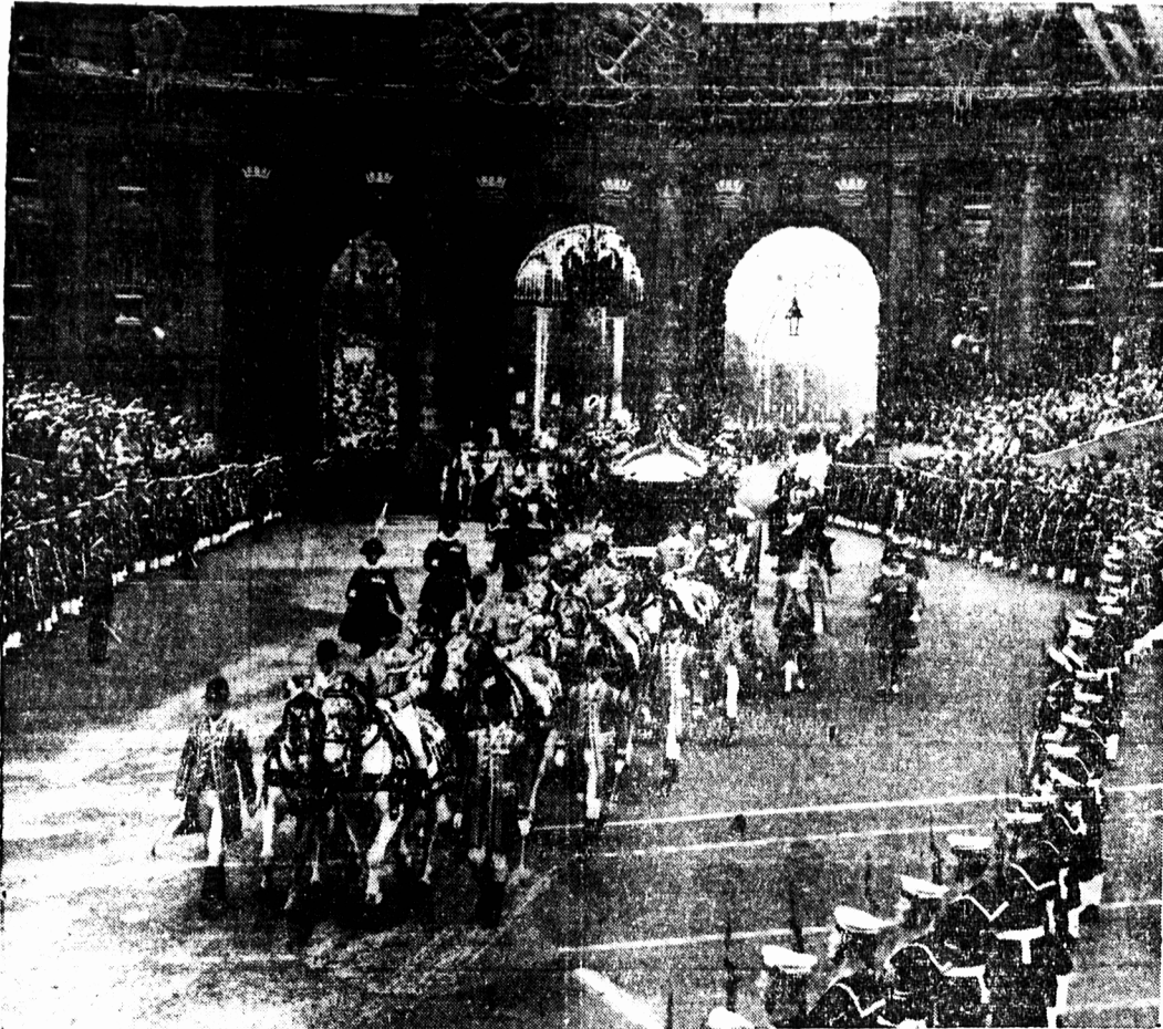
The gilded coach of state, drawn by the famed Windsor Greys, is shown passing under Admiralty Arch on the return to Buckingham Palace.