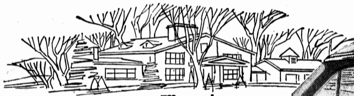
Where a fine car matters Monarch belongs.