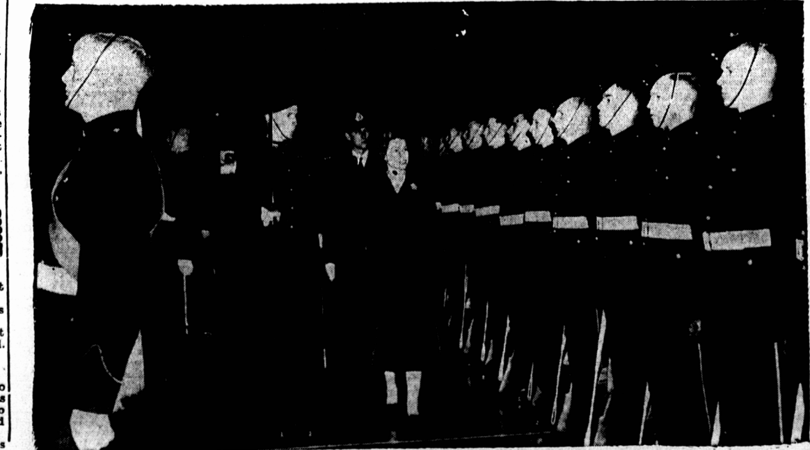
PRINCESS INSPECTS NAVAL CADETS AT ROYAL ROAD, ESQUIMAULT, B. C.

"Mary," he whispered, "let's have a boy. Has ye forgotten the lad's cap we found in the train?"