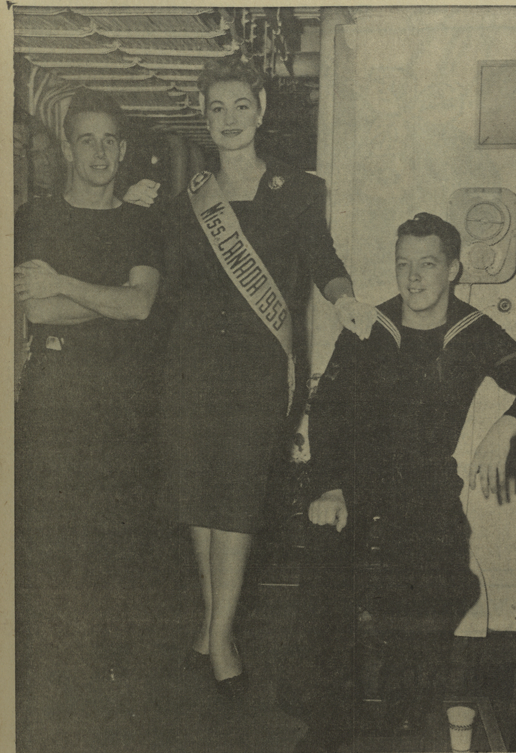
CITY SAILOR MEETS MISS CANADA

Through the pool, it was charged, patent infringement suits were threatened and instituted against manufacturers or dealers who tried to ignore the agreement, and dealers were refused licences if they indicated intention of importing U.S.-made merchandise.