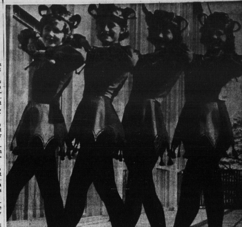
MAJORETTES WITH VANCOUVER BAND

The pipe smoking contest will take place Friday night at Civic Stadium.