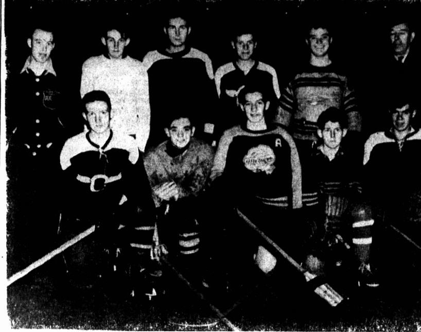
The Georgetown Boy Scouts hockey team, three-time winners of the Island Scout hockey championship is pictured above. The Georgetown scouts won the championship this year by defeating a rugged team from O'Leary in the finals. This is the third year