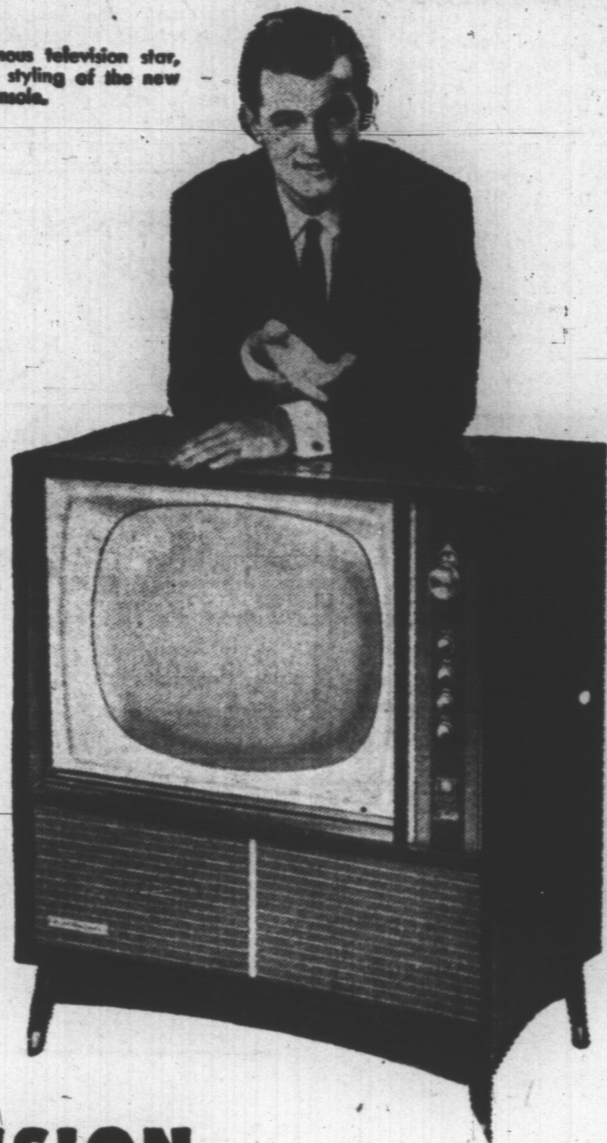
BOB GOULET, famous television star, shows the graceful styling of the new "BIRDALE" 21" Console.

VATICAN CITY (Reuters)—Pope John called on the world's Roman Catholics to show more intense devotion to the Virgin Mary in a broadcast message made public here Saturday. The Latin broadcast was made Friday to the second World Congress of Marian Congregations at Newark, N.J.