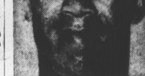
Maury Wills Stresses Basics