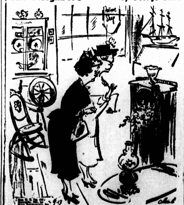
"How charming—it's made from an antique television set."