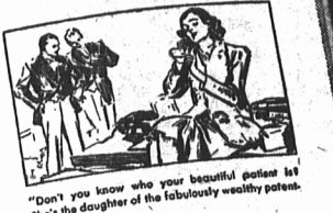
"Don't you know your beautiful patient is the daughter of the fabulously wealthy potent food king!"