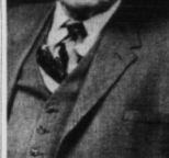
TO BE HONORED

By RUSSELL FEDEN MONTREAL (CP)—The maximum-security St. Vincent de Paul Penitentiary was nearly totally wiped out Sunday by fires set by rioting prisoners. Prisoners battled the guards, the Quebec Provincial Police, RCMP and finally the army as firemen from four cities, their job harassed by gas and lack of water, gave up on all buildings within the walled central area of the prison except for the main block housing cell wings and the administration.