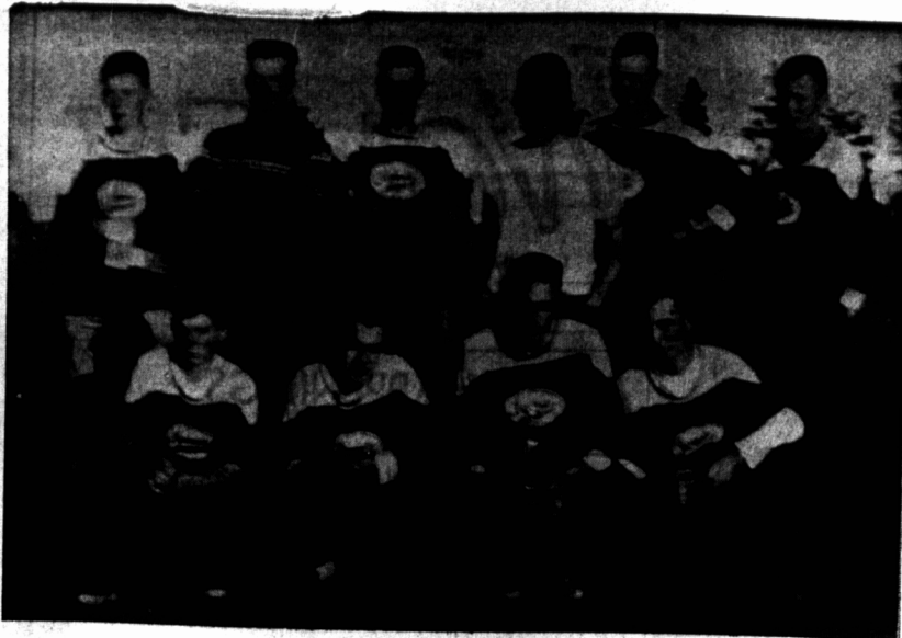
KING'S COUNTY SOFTBALL CHAMPS

This moving of minor managers to major league jobs isn't without precedent, of course. It's just more in the nature of a trend. Last year Joe McCarthy who did pretty well.