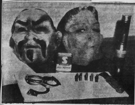
USED IN HOLDUP

These items were found by police officers in vehicles left behind by thieves who escaped with at least $50,000 after looting a mail truck from the CNR station parking lot at Sherbrooke, Que., 85 miles east of Montreal. No other trace has been found of the robbers.