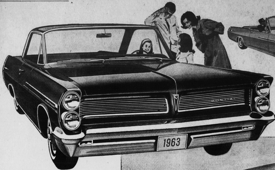
PARISIENNE SPORT COUPE Crisply new for '63 all the way from its distinctive new grille to the smooth rear fender line, the Parisienne shows how Pontiac sets the pace for '63.