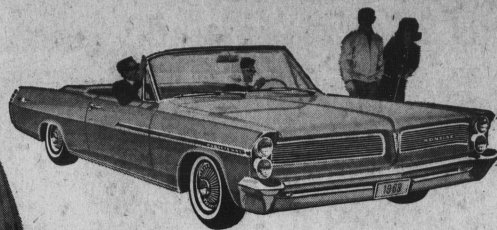
PARISIENNE CONVERTIBLE This is where the '63 Pontiac really steps out. As racy and cool in the summer as it is warm and snug in the winter, the Parisienne convertible also offers you bucket seats as an extra cost option.