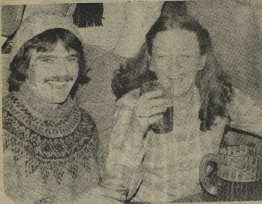
Laughter in a bar