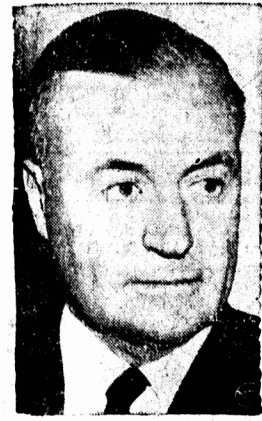
Adm. Forrest P. Sherman Navy

"General Vandenberg has commanded, I think, the largest pursuit or battle formation of planes, in contrast with bombers, of any man in history. That is a considerable experience."