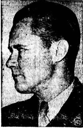
Gen. Hoyt S. Vandenberg Air Force

"General Bradley has... commanded the largest force of ground troops in history, ours or anybody else's, in the field; so he is not inexperienced; aside from being a very level-headed man, and one of great honesty of purpose."