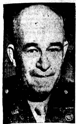
Gen. Omar N. Bradley Chairman

Defense Secretary George Marshall, testifying in the MacArthur and Far Eastern policy hearings, paid high tribute to the Joint Chiefs of Staff. Said he: "I frankly doubt that this Government will ever be so fortunate again as to have such a collection of experience at one time in the Chiefs of Staff." Below are the four military leaders and, in Marshall's own words, his estimate of each.