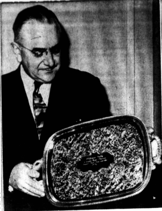
PUTS UP BEEF TROPHY