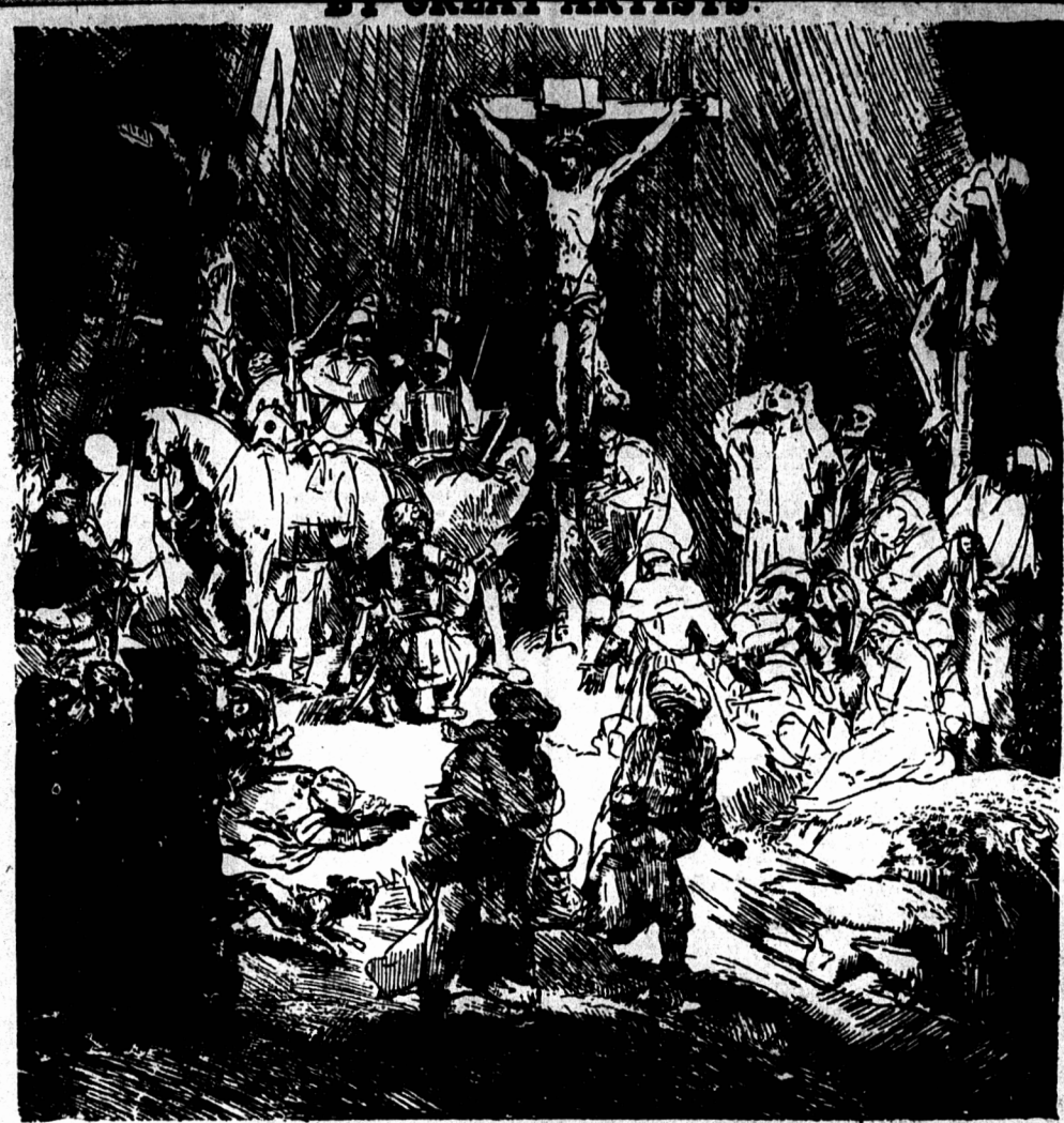
TODAY, NO. 10: THE CRUCIFIXION

Rembrandt van Rijn, the Dutchman (1606-1669), unquestionably was the greatest etcher of all time. His style was distinctly his own: he avoided straight lines and used broken outline and loose arrangements. He produced more than 1000 etchings and drawings and some 600 paintings. None are more memorable than his etchings Raising of Lazarus , Ecco Homo , and the etching reproduced here, The Crucifixion . Matthew, Mark, Luke and John all have majestic stories of the Crucifixion. This is from St. Matthew 27:45-54: