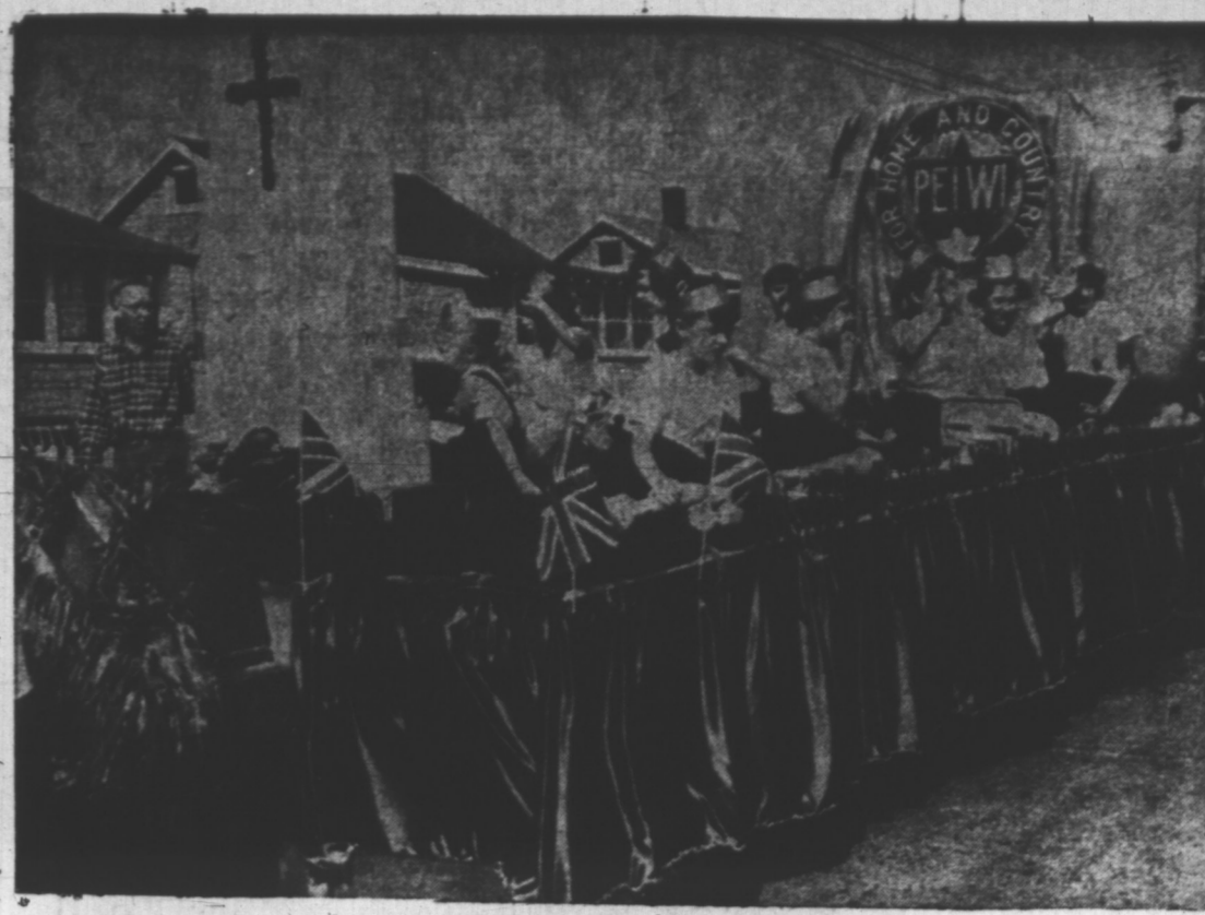
WOMEN'S INSTITUTE FLOAT