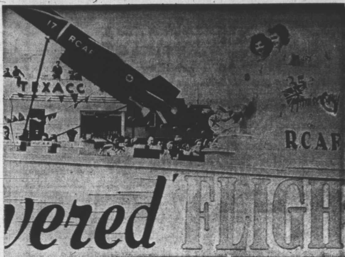
THE RCAF FLOAT AND WINNER OF THE BILL LYNCH TROPHY