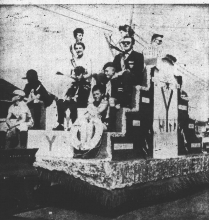
THE Y'S MEN'S FLOAT