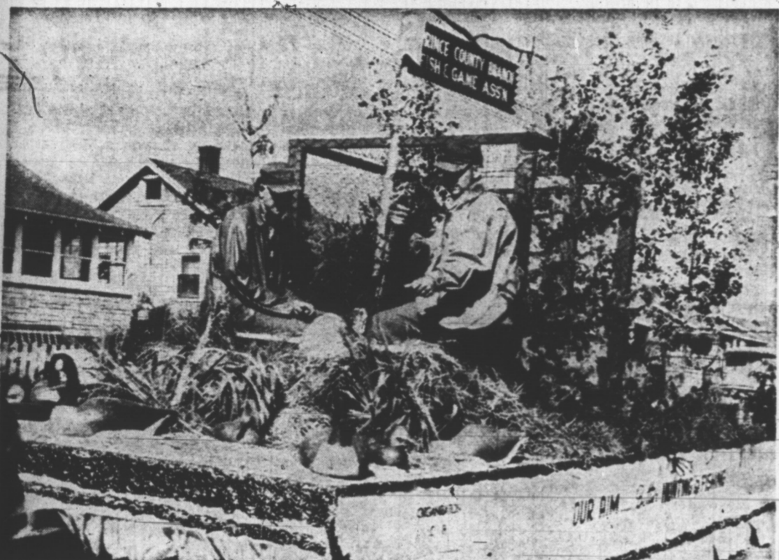
THE FISH AND GAME FLOAT