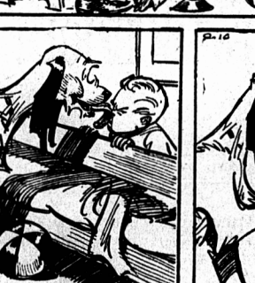
GOLLY UNAPLEON, THIRTY CENTS AN HOUR BUT ENOUGH PAY FOR STAYING WITH THAT BRAT HE'S BEEN VOWLING THAT HE'VE TRIED EVERYTHING ON HIM!