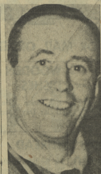
LORD ROWALLAN perial headquarters. Monday the Chief Scout will