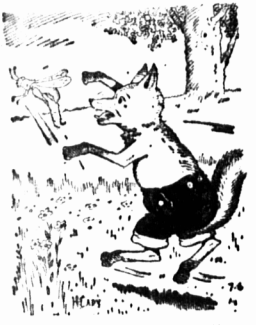
Then he raced after it.

—Old Mother Nature— Always it is easier to work when work is fun. And the easier it is to do a thing, the better done it is likely to be. Over in the Green Forest three little Foxes were getting their first lessons in how to live out in the Green World. They were the children of Gray Fox and Mrs. Gray, who are cousins of Reddy Fox and Mrs. Reddy.