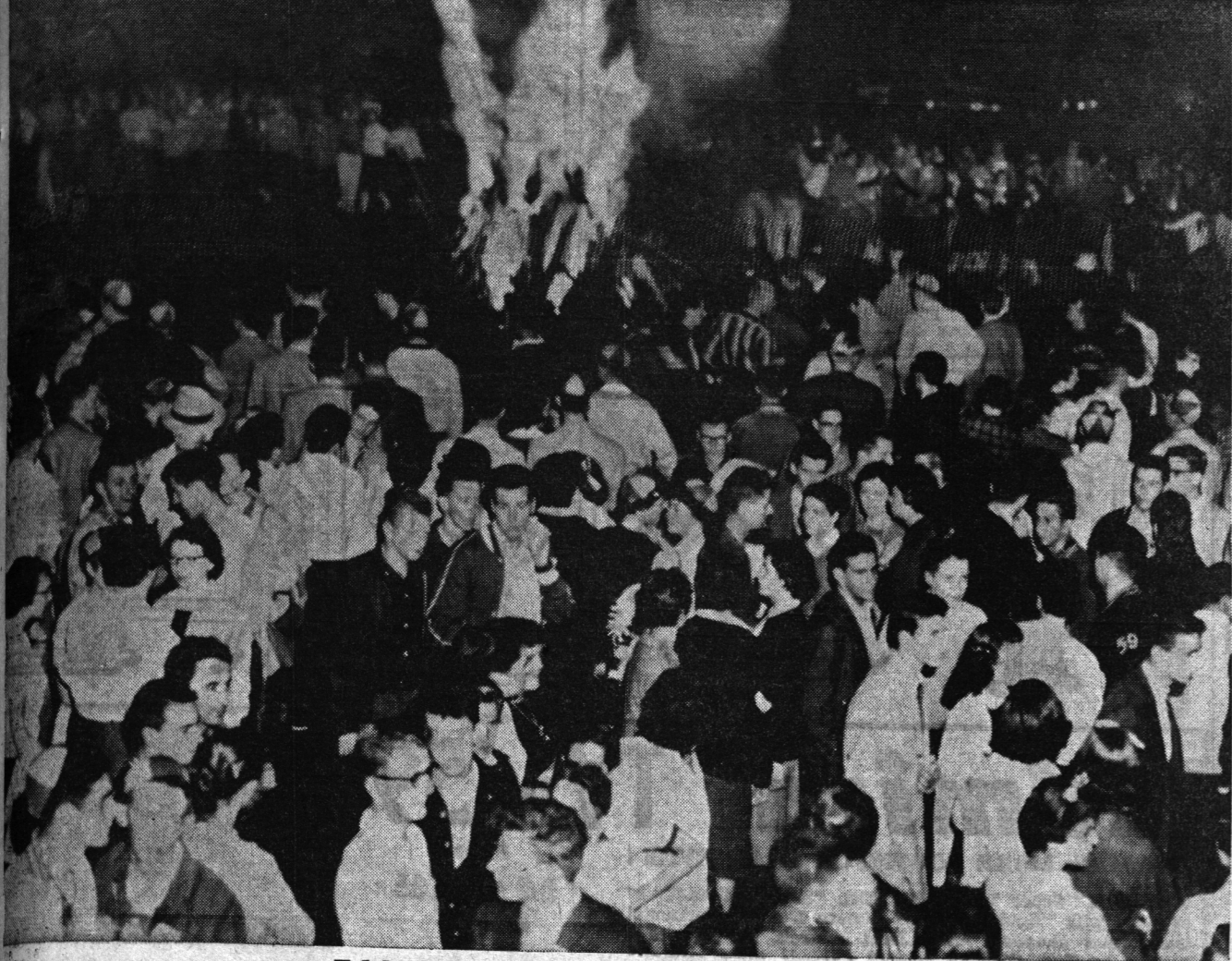
FAUBUS 'BURNS' AT OTTAWA OTTAWA, — University of Ottawa students burned in effigy Governor Orval Faubus of Arkansas. A proclamation read by student leaders before torches were touched to the pyre said the governor stands condemned in the eyes of Canadian students for his stand against integration in schools of white and negro students. A dummy of Faubus was consumed in the flames.