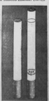
NEW CONTINENTAL KING SIZE. Noticeably longer, more satisfying than any regular cigarette.

THE WORLD STANDARD OF CIGARETTE EXCELLENCE