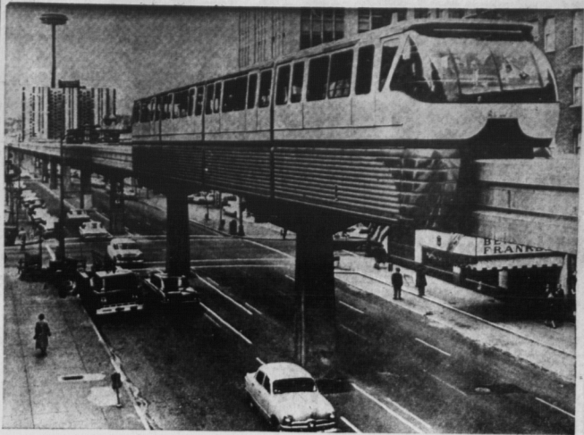
MONORAIL CARRIES SEATTLE FAIR PASSENGERS