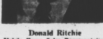
Donald Ritchie Mobile Home Sales Representative

Low Down Payment Only $1,000 to $2,000 down on a new MOBILE HOME—COMPLETELY FURNISHED—Only $500 required for a used MOBILE HOME.