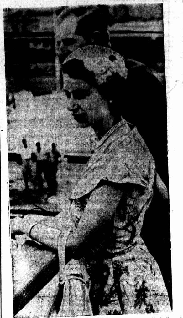
From the bridge of the royal liner Gothik, Queen Elizabeth and the Duke of Edinburgh view with interest the passing panorama of the Pacific ocean as they head for the Fiji Islands from Panama.